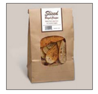
Bag and display for incremental sales and profit!